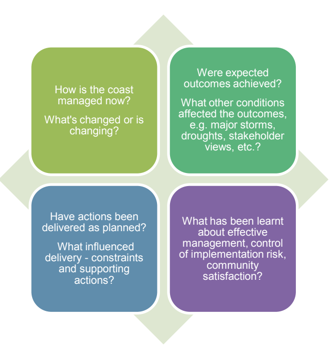
Figure B1.3: Reviewing current management arrangements

Given that the government intends that public authorities and councils will continue to build on what has already been achieved through these planning and implementation processes, the management review can be summarised by Figure 1.3 .